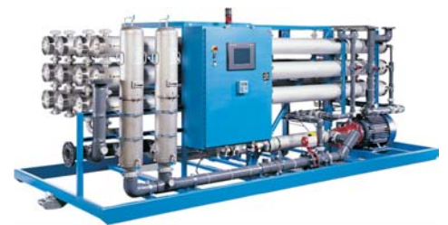
PRO Series Reverse Osmosis Equipment

Two Superfund landfill sites in Colorado and California needed to meet landfill leachate regulations. Water Technologies developed a reverse osmosis spiral wound thin film composite membrane technology to remove heavy metals and organics.