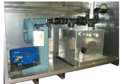
ProSweet™ OC2533 Odor Neutralization

Privately owned landfill near the Great Lakes was experiencing numerous complaints from its Northeastern neighbors. It switched odor control treatment from a cherry masking agent to ProSweet™ OC2533 vaporless neutralizer and eliminated neighbor complaints.