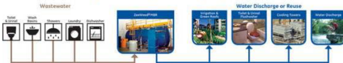
Dockside Creek Wastewater Treatment and Reuse System Flow Diagram