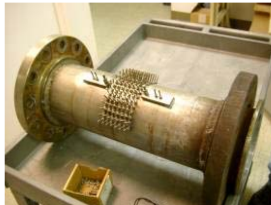
Figure 1: Resistance Corrosion Monitor

During a planned outage, subsequent inspection using Digital Radiography confirmed the effective corrosion control results and the program continues successfully.