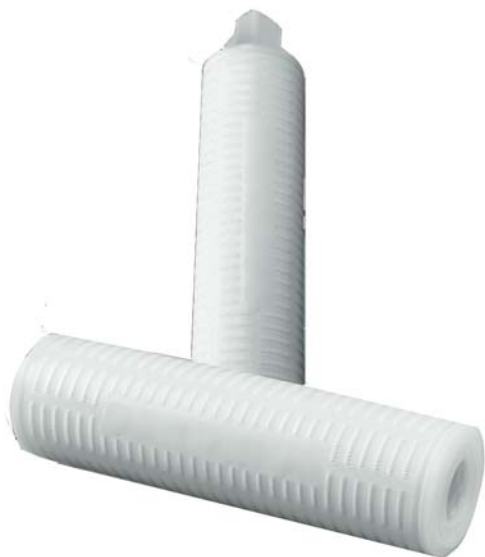
Figure 1: Memtrex PM (MPM) Pleated Filters