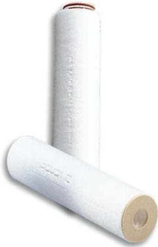
Figure 1 : Selex Depth Cartridge Filters