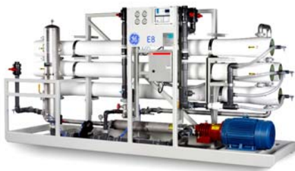
Figure 1: E8

Like all of our standard RO machines, the E8 RO (Figure 1) comes completely assembled, ready for use. E8 models are available in configurations ranging from 57,000 to 144,000 gpd (9 to 23 m 3 /hr). All machines come standard with a Tonkaflo* multi-stage centrifugal and packed with Desal* membrane elements. The smart controls keep it simple and operate the entire system. Plus, our E8 ROs are priced for the budget-conscious consumer.