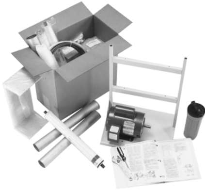
Figure 5: EZ Kit

assemble with the help, guidance and expertise of a qualified water conditioning professional. All kits are packaged for shipment by ground, air, or ocean freight.