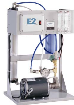
Figure 4: E2