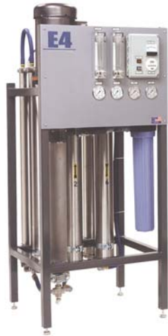
Figure 2: E4