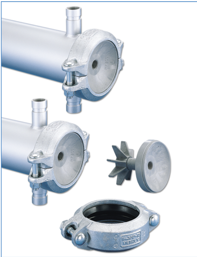
Figure 1: Stainless Steel Membrane Housings

GE Water & Process Technologies combines our rugged design of stainless steel membrane element housings with 30+ years of history in the applications of RO/NF/UF machine assembly.