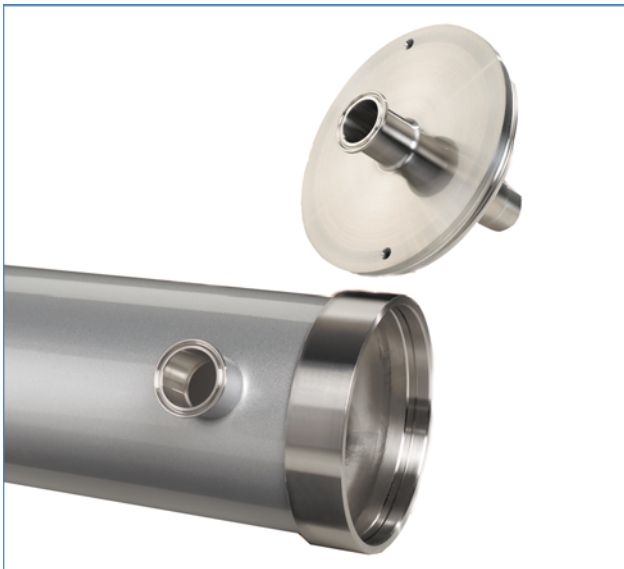
Figure 1: Sanitary Stainless Steel Membrane Housings

GE Water & Process Technologies combines our rugged design of stainless steel membrane element housings (Figure 1) with 30+ years of history in the applications of RO/NF/UF machine assembly.